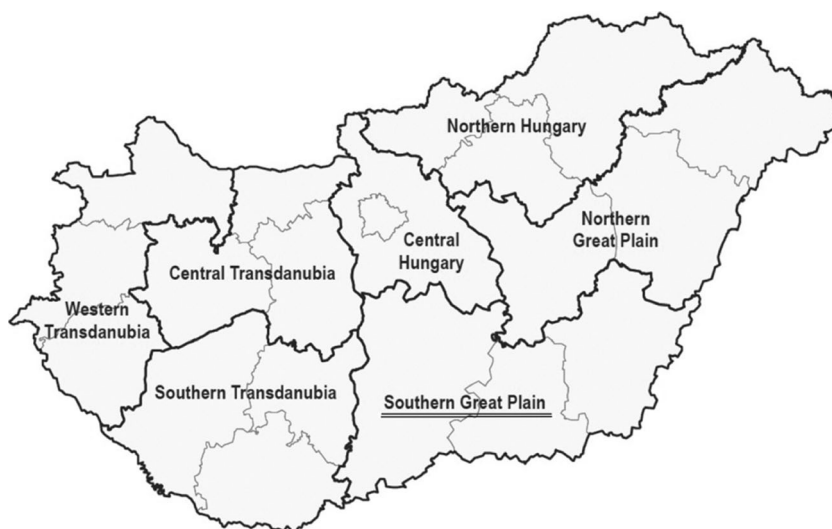
Fig. 1 Introduction of the area of our regional centre in Hungary that caters for the population of three counties in south-eastern Hungary (Southern Great Plain)

C-KIT mutation examinations are made on every bone marrow biopsy sample evaluated at our centre. Only those cases are considered to involve SM which comply strictly with the WHO 2008 criteria (1 major+1 minor or at least 3 minor criteria together). In Hungary, serum tryptase level measurement is currently still not available, but (even without the determined tryptase levels) all of our presented cases meet the WHO criteria of 2008.